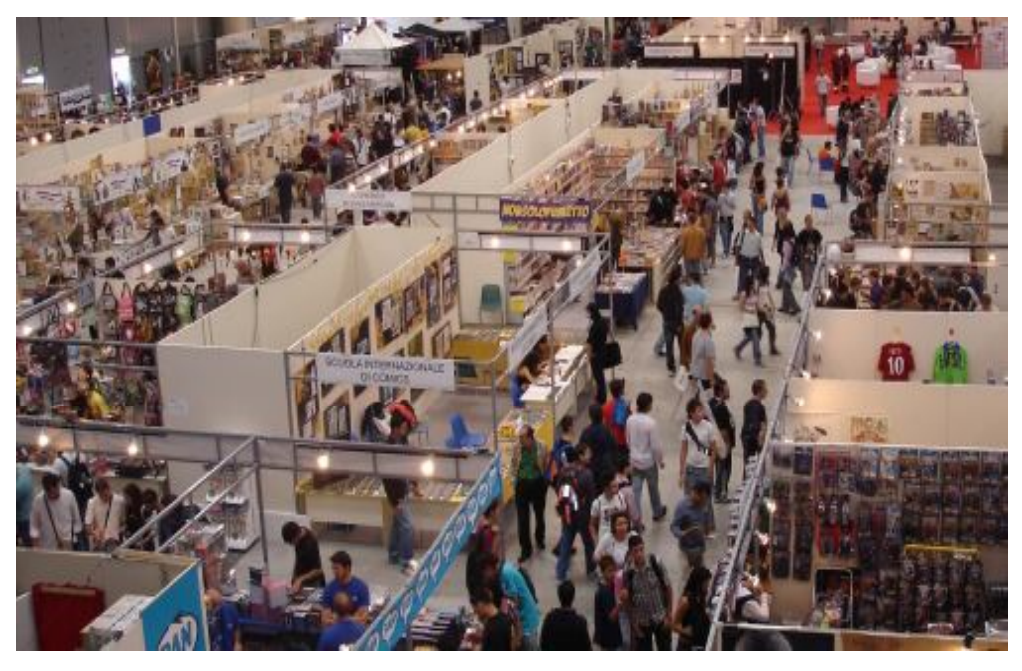
Visitors to Romics