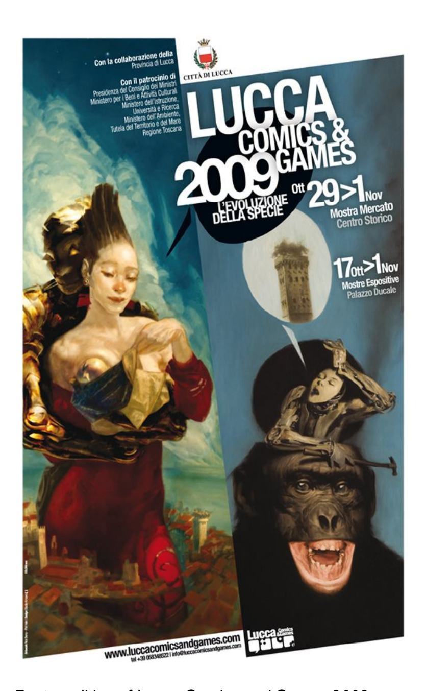
Poster edition of Lucca Comics and Games 2009